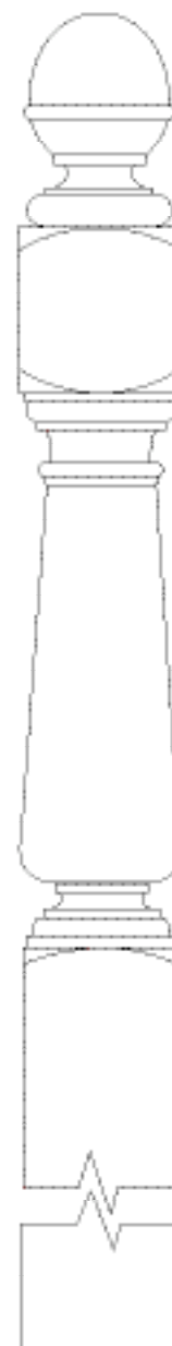
PP1A Acorn Top