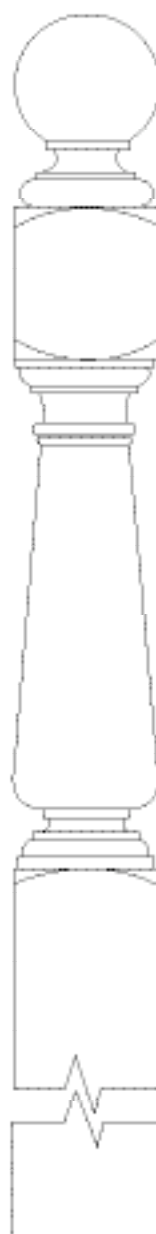
PP1B Ball Top